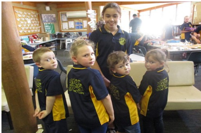
Step into Prep and Year 5 students working together