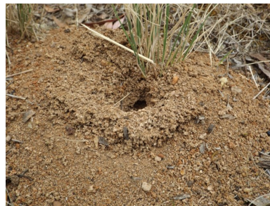
Left: Built up anthill Below: Washed away bank

The above piece was written days before we had over five hours of non-stop thunderstorms, hail stones, and 11mm of rain on Sunday. Perhaps the Bureau of Meteorology should employ some ANTS!!!