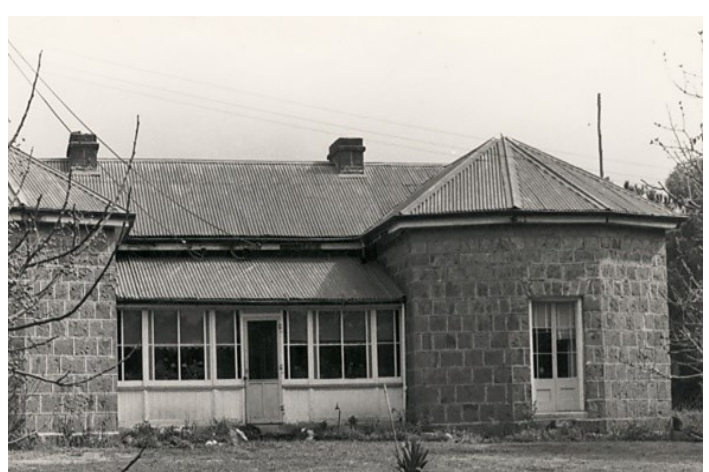
Glenmona Homestead on Bet Bet Creek. The shadow from a pole like the one here could be used to determine midday to an accuracy of less than a minute.