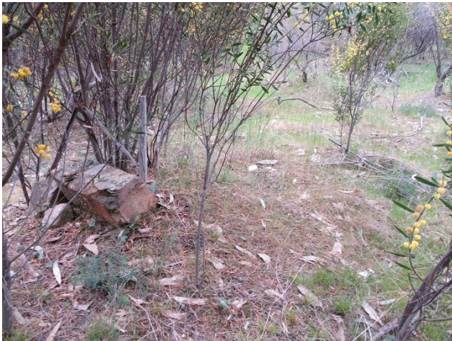
One of the graves near Waanyarra Cemetery