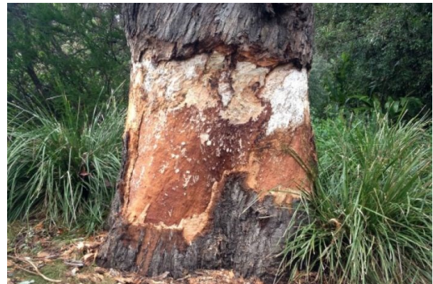
Damaged Separation Tree after vandals attacked it in 2013.