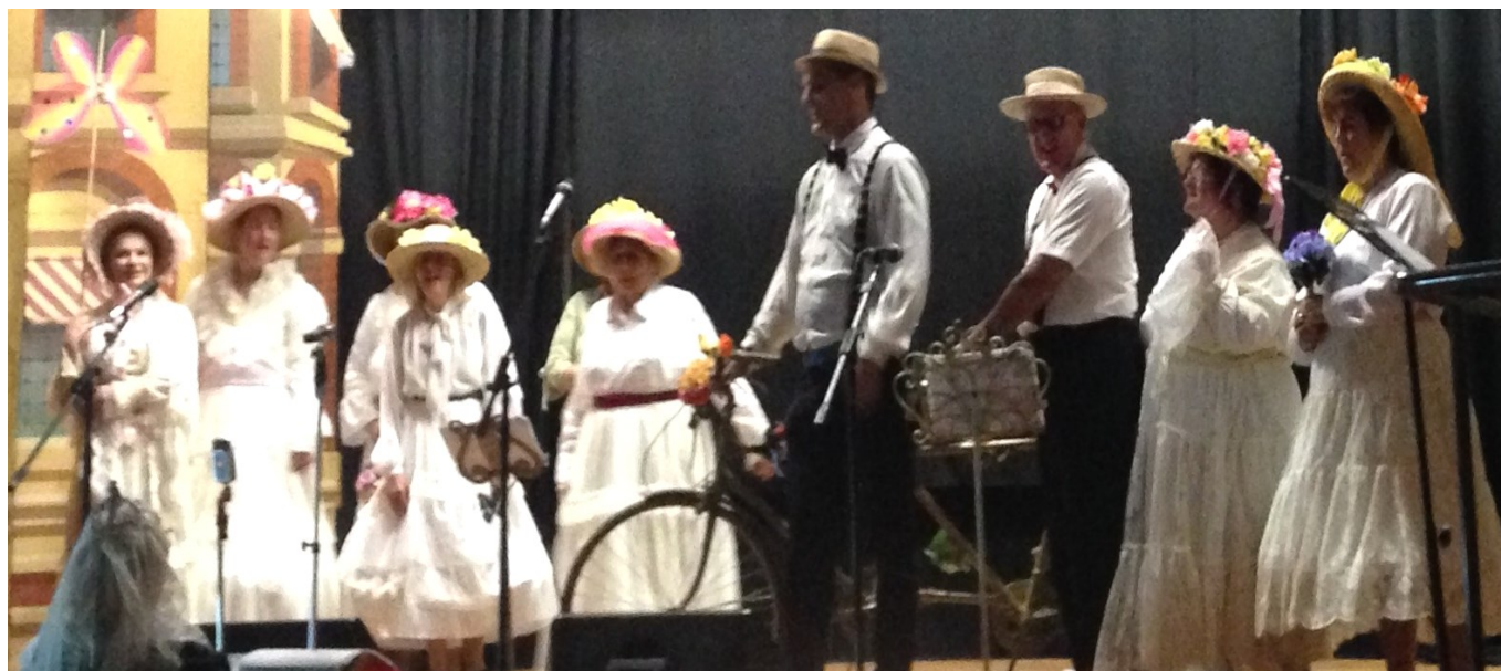
The Dunolly Follies singers - performing "Daisy"