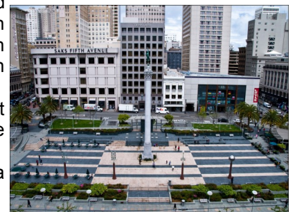
Union Square, San Francisco