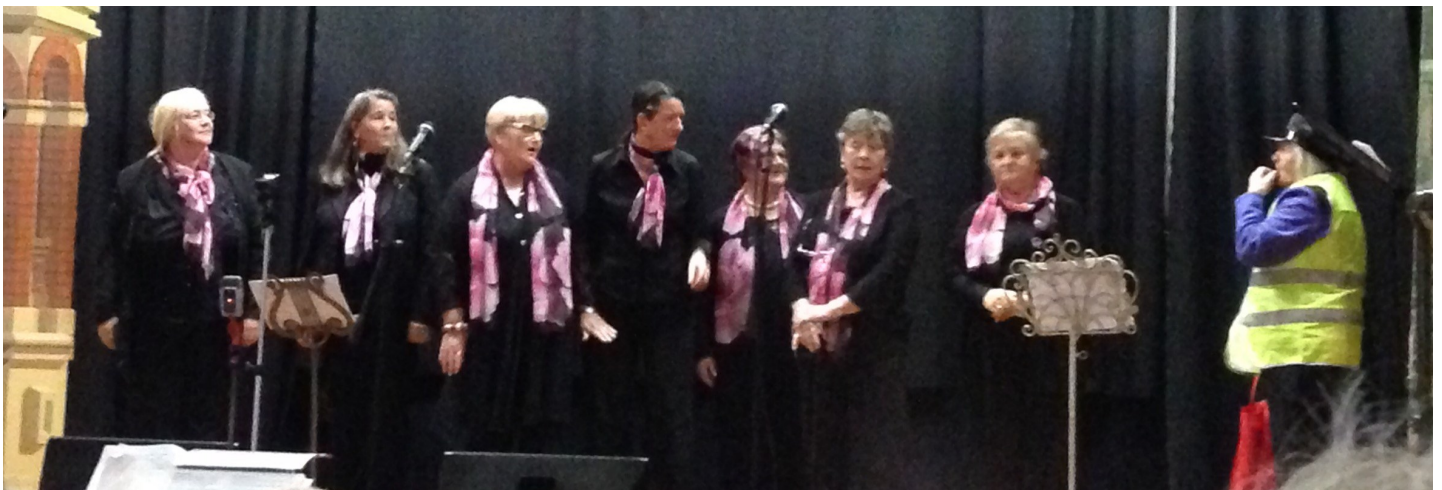
The D Sharps paying tribute to the postal service (sort of) with Mr Postman.