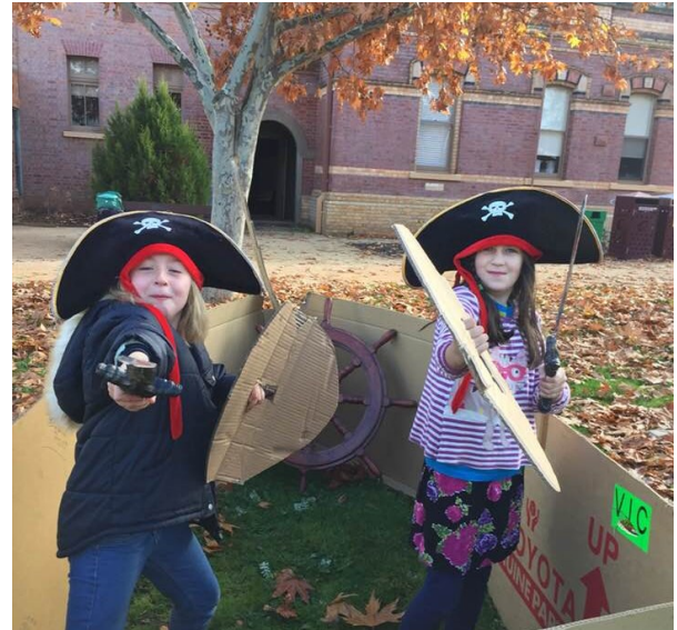
Mini pirates brandishing swords at Cardboardia