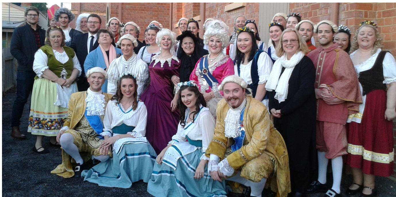
The Savoy Opera Company - cast of The Gondoliers