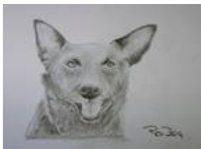
Red Dog in Pencil

Acrylic, oil, water colour, or pencil? That is the question