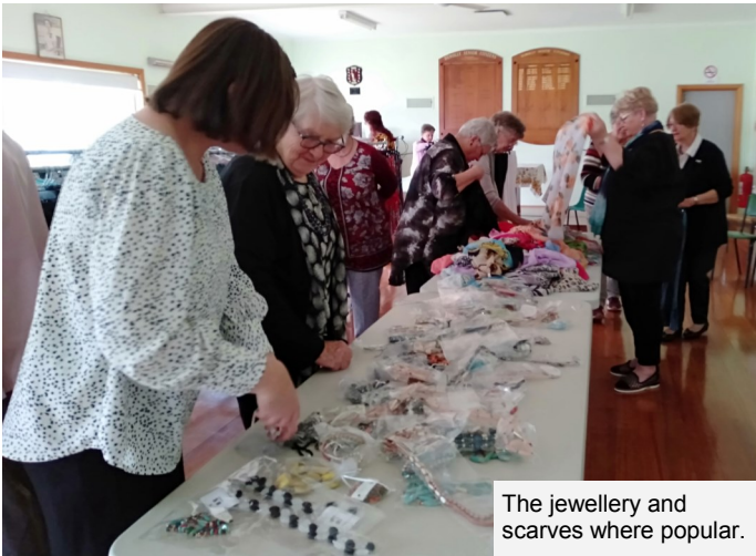
The jewellery and scarves where popular.