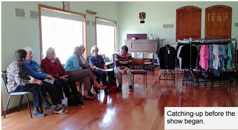
Catching-up before the show began.

A fabulous array of clothing was shown at the Dunolly CWA Fashion Parade last Friday 20th. The good-sized group enjoyed a varied and large display of clothing and accessories. There was much to choose from, so deciding took a while, but purchases were made. Afternoon tea was especially enjoyable, as with the clothes, there was a good selection of savoury and sweet treats were on offer.