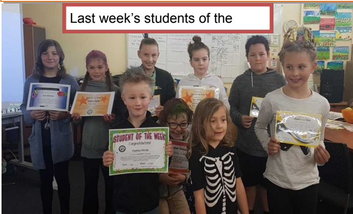
Last week's students of the