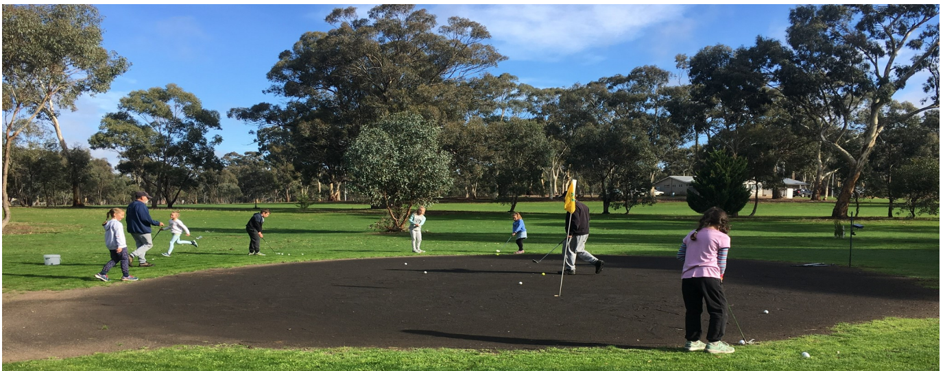
Budding Golf Superstars - Junior Golf Program at Dunolly Golf Club on Sundays at 10am - photo by Mel Schodde