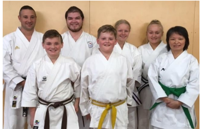
Thank you to THE WELCOME RECORD for your support