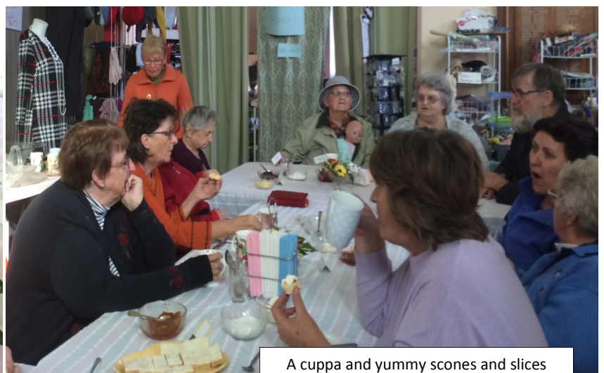
A cuppa and yummy scones and slices