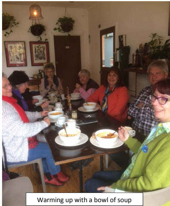
Warming up with a bowl of soup

After a very hearty bowl of soup, some delicious hot chocolate and scones in the wonderful café, we headed for home after a thoroughly enjoyable day, despite the cold. Many thanks to some