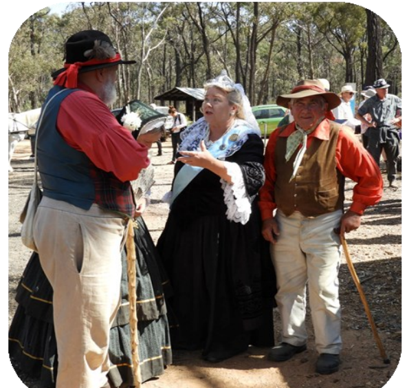
Being greeted by Queen Victoria