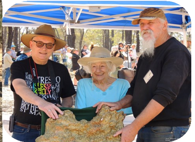
Descendants of the men who found the gold nugget, holding a replica of the nugget