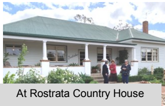
At Rostrata Country House

The Loddon Visitor Information Centre boasts an enthusiastic team which promotes the Loddon Valley and wider region to visitors and residents by providing information and visitor services. Volunteers are well supported to carry out their duties and this includes a familiarisation tour that enhances their knowledge and ability to cater for the thousands of visitors to walk through the doors of the visitor centre every year.