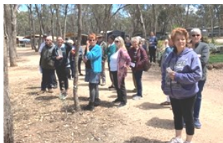
Laanecoorie Lakeside Caravan Park

team prepare fresh stylish wholesome food and provide a welcoming country atmosphere. The volunteers enjoyed a delicious selection of cakes and slices, including gluten free.