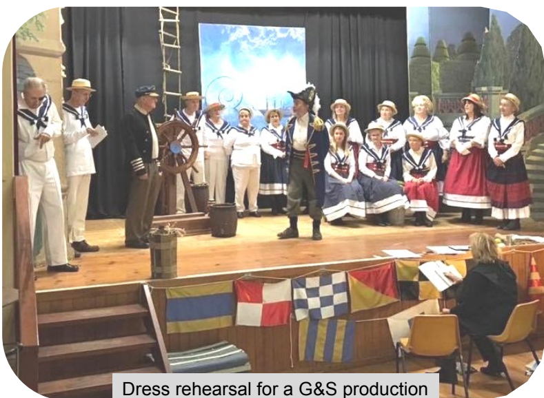
Dress rehearsal for a G&S production

One change is that we will amalgamate the two companies.