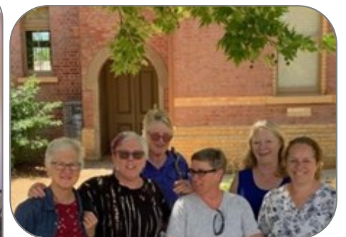
Six of the seven visitors, one behind the camera