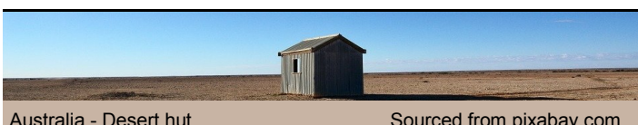
Australia - Desert hut