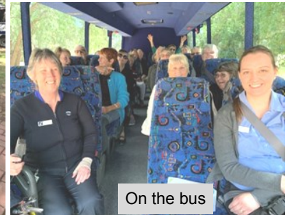
On the bus