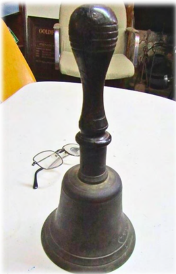
Bell in Dunolly Museum with unknown provenance but matches Town Crier's bell