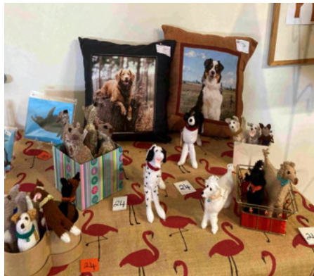
Below: Examples of the lovely artworks displayed on the day.